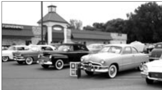
Top: Roger’s beautiful ‘42 Lincoln, with his ‘37 Studebaker Pickup in the background; TCRG cars are always popular at car shows