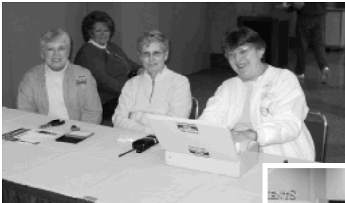
Good luck getting past this Security Team!