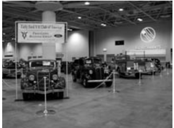
The diagonal look helped to showcase our V-8s