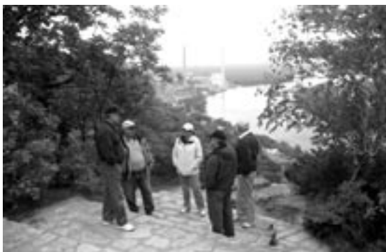
Great Meet destination: Garvin Heights