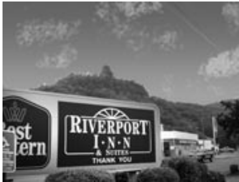
Sugar Loaf from the hotel parking lot