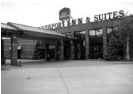
Meet Headquarters, Winona, MN