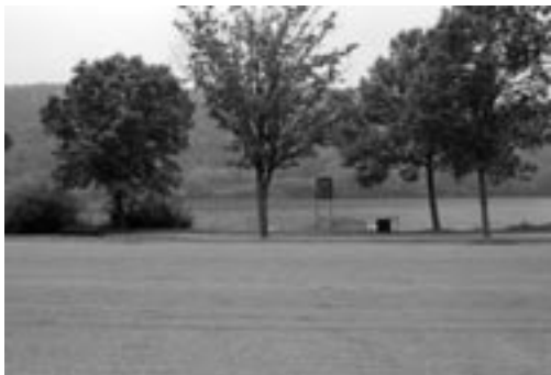
Lake Winona directly behind the Concourse