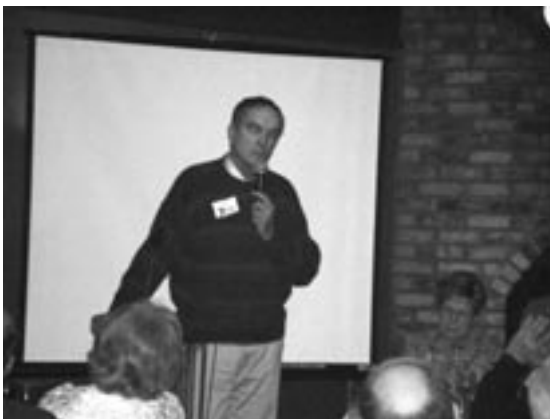
Guest Speaker Al Batt entertains the members with stories growing up in rural Minnesota