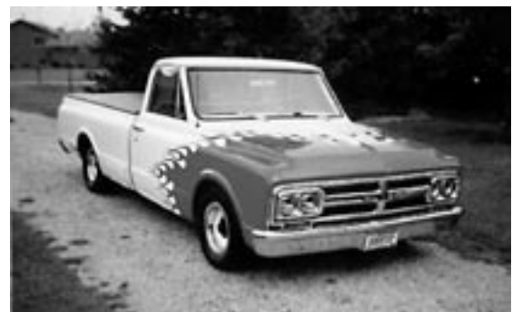
Tom and Renee Fritz's '67 GMC Pickup